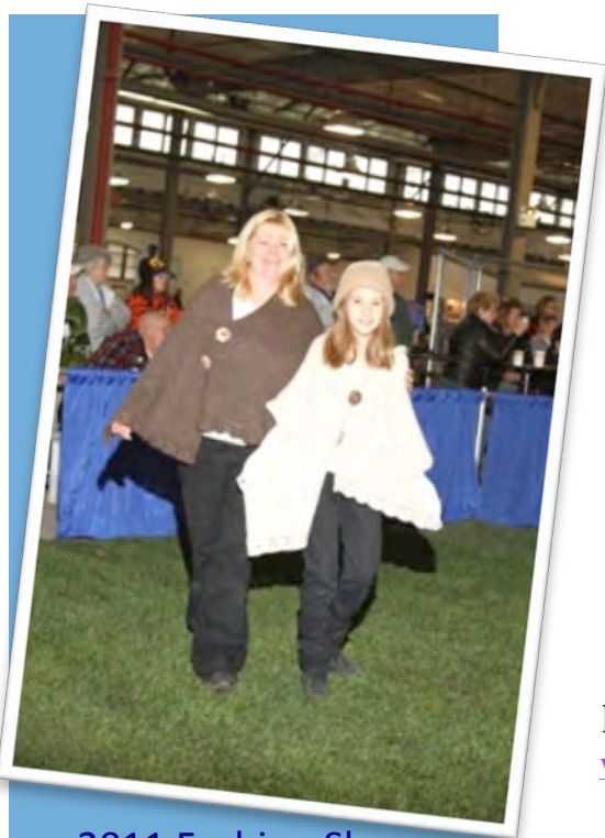
2011 Fashion Show

Crosswind Farm Alpacas Indian Trail Farms Marble River Alpacas Sage Hill Farms Alpacas Salmon River Alpacas